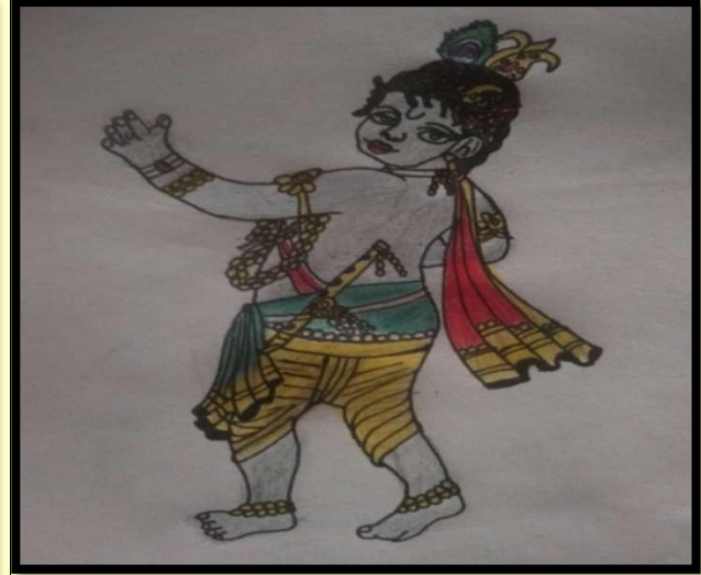
MANSI RAJPUT 7<sup>TH</sup> D