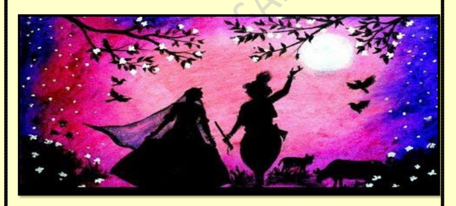
KARANPREET KOUR 6<sup>TH</sup> A