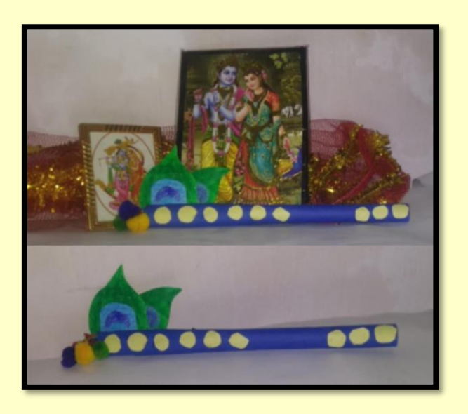
RUCHI BHAGAT 6TH B